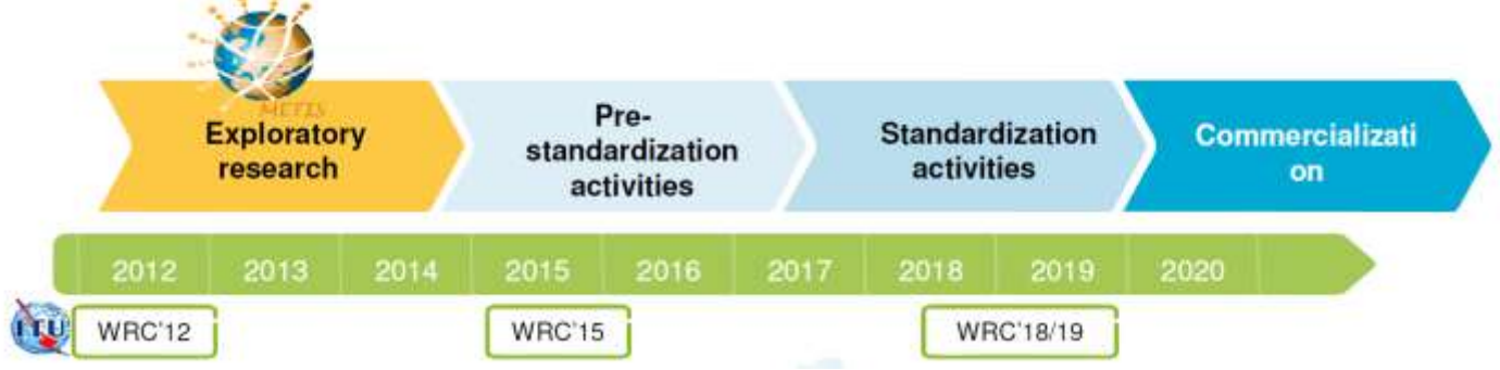
Figure 1: 5G development timeline

The main driver of 5G technology development seems to be the funding from the governments that believe that 5G will boost economic activities. Basic research has already started, and the first round of proposals will be submitted in November 2014. Standardization of 5G is expected to start in 2018 and scheduled to be finished by 2020. It is also speculated that the first 5G systems will be deployed around 2020 and will become the dominant wireless technology by 2025. METIS, which is a consortium of industry heavyweights, set the project objective as shown in the following figure.