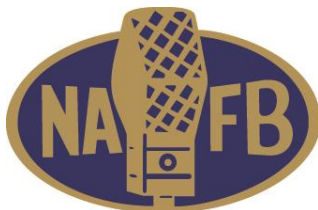
National Association of Farm Broadcasting