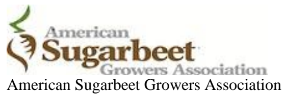
American Sugarbeet Growers Association