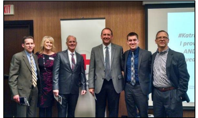
Red Cross Everyday Heroes of NE Iowa KWWL Staffers